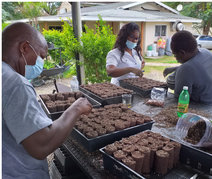
Trial at Kingston Nursery sowing seeds in paper pots to improve root development and reduce plastic use.